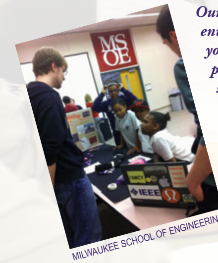
MILWAUKEE SCHOOL OF ENGINEERING

Our Outbound Learning Program provides an innovative solution to the problem of poverty by exposing youth to worlds they would otherwise never imagine. In 2003 we reached out to the larger community looking for Outbound Learning partners who would welcome our children to their sites each week. After school, volunteers at each site become one-on-one tutors and mentors, and our youth experience a caring and supportive environment and stimulating activities. Partner sites include University School of Milwaukee, ManpowerGroup, St. John's on the Lake Retirement Center, MSOE, and UWM. Froedtert Health will soon become an Outbound Learning partner.