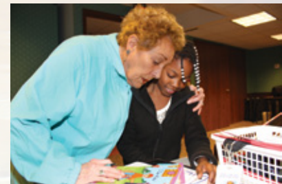
SAINT JOHN'S ON THE LAKE