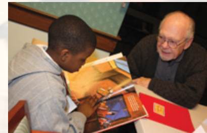
SAINT JOHN'S ON THE LAKE