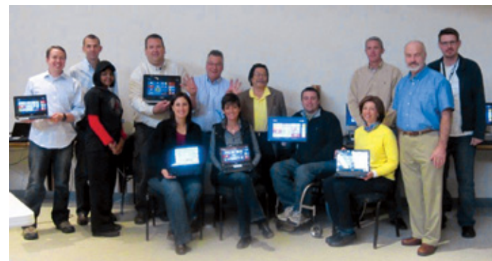
Microsoft volunteers and our staff celebrate the completion of hardware setup and software installation at our center.

employees responded generously to their appeal, and Microsoft Corporation matched their gifts.