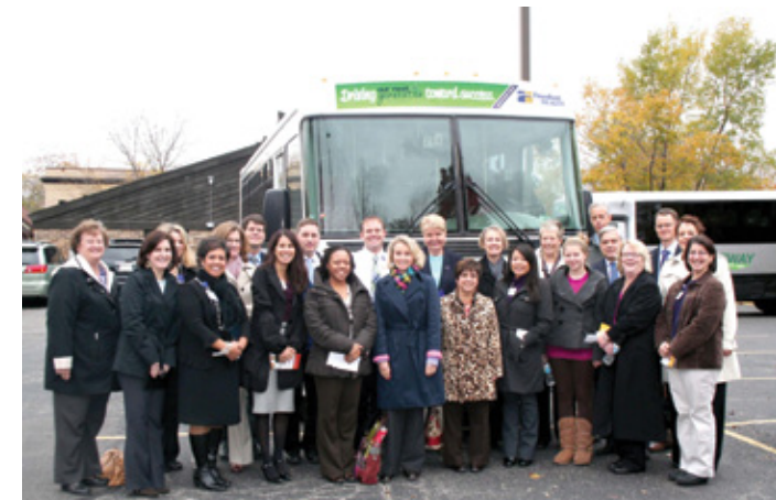
Froedtert Health executives gathered at our center to celebrate the acquisition of our new bus