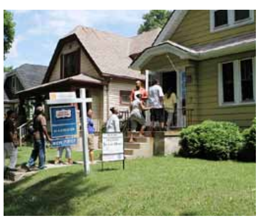
HOME OWNERSHIP PROMOTION ACTIVITIES