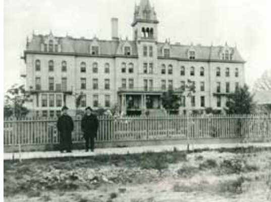
SACRED HEART SANATORIUM ON LAYTON BOULEVARD - 1893*