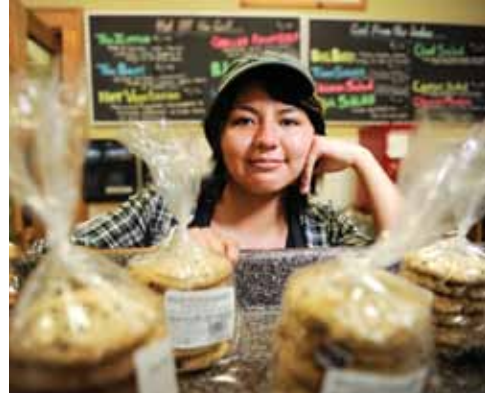
VIENTIANE NOODLE SHOP