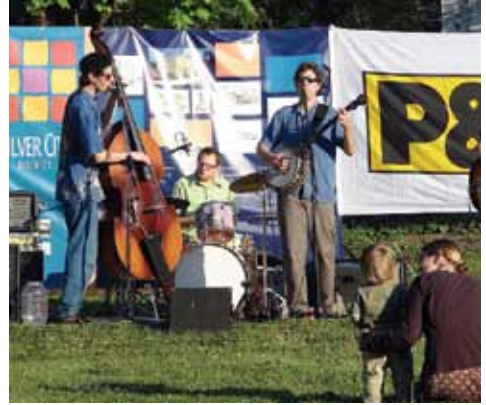
SOUNDS OF SUMMER CONCERT IN ARLINGTON HEIGHTS PARK