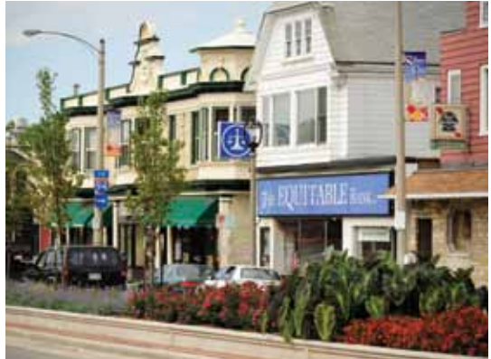
WELCOME TO OUR COMMUNITY!