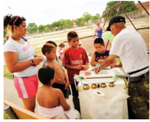
ICE CREAM VENDOR IN BURNHAM PARK