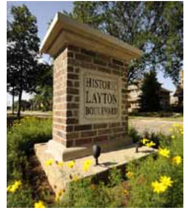
HISTORIC LAYTON BOULEVARD MONUMENT