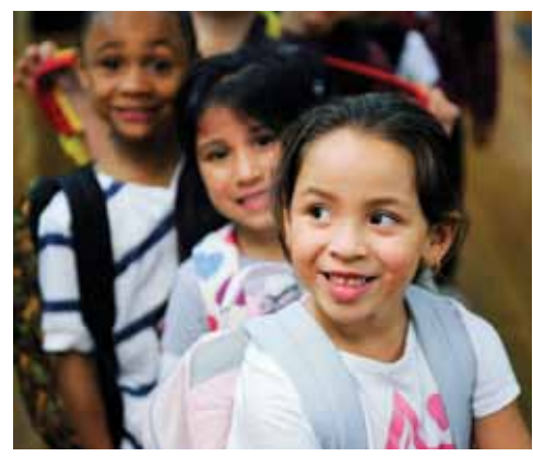
NATIVITY JESUIT MIDDLE SCHOOL