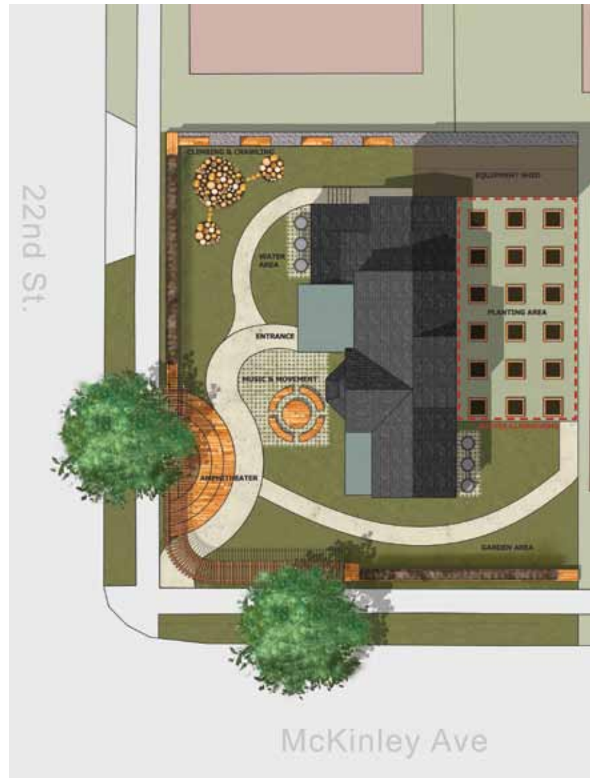
The TREE House is located at 2130 W. McKinley Avenue, just west of downtown, near the Milwaukee High School of the Arts and Marquette University.

Executive Director – Outdoor Classroom Project