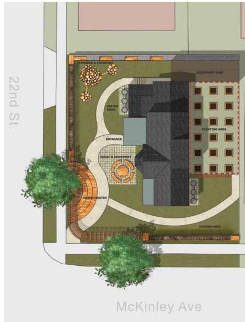
The TREE House is located at 2130 W. McKinley Avenue, just west of downtown, near the Milwaukee High School of the Arts and Marquette University.

Executive Director – Outdoor Classroom Project